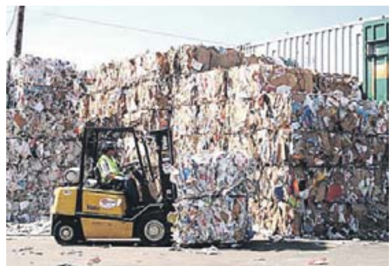
Pacific Rim currently recycles for Lamorinda